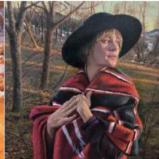
Tim Spransy, Hope , oil (detail)