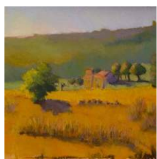
Audrey Dulmes, Perpetual Dazzlement , soft pastel