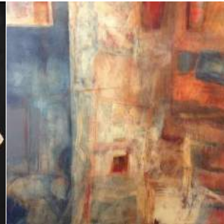
Claudette Lee-Roseland, Heart of Downtown , oil