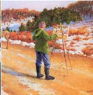
Ken Stark, Plein Air (detail)