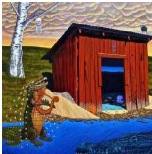
Valerie Mangion, Watershed , oil (detail)