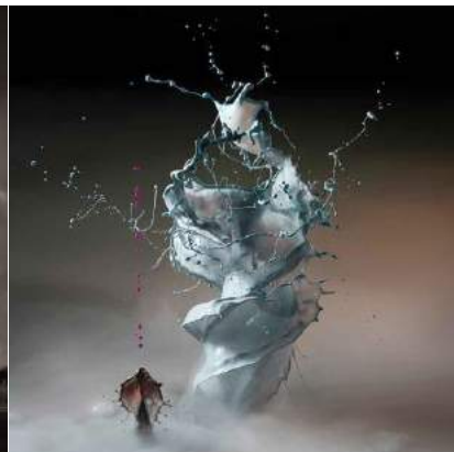
Jack Long, Platinum Mist (detail)