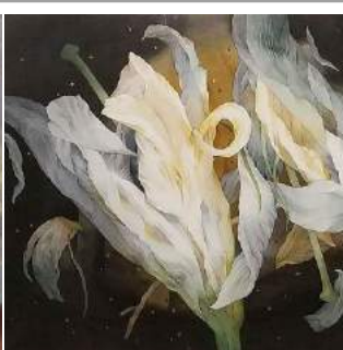
Jean Crane, Lilies in Space , watercolor (detail)