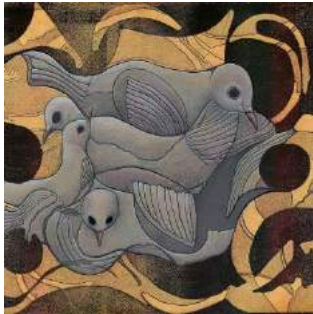
Jewell Riano-Bradley, Huddled Doves , collagraph (detail)