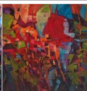
Virgilyn Driscoll, Earth Song , oil