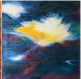
Susi Schuele, Shine , Stain on cradled wood