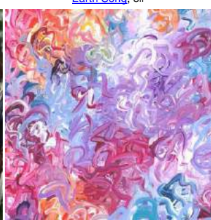
Jane Gates, Inside the Lotus #2 , acrylic (detail)