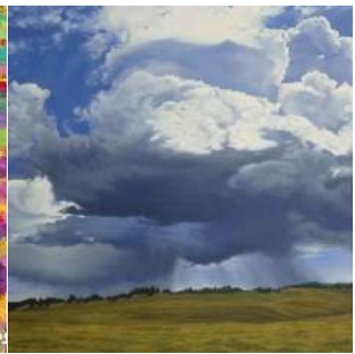
Liz Phillips, Black Hills Exhibition , oil (detail)