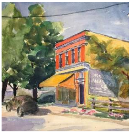
Elsa Ulbricht, Untitled (Hardware Store) , Watercolor on paper, 13 x 18

The Gallery of Wisconsin Art CONSIGNS, SELLS and BUYS artwork by early Wisconsin artists!