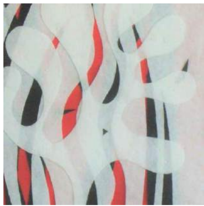
Lucia Stern, Untitled , Cut fabric collage with stitching, 13" x 10"