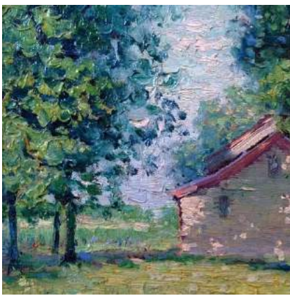
Francesco Spicuzza, 'Cottage in the Woods' , Oil on board, 7.5x 5.5